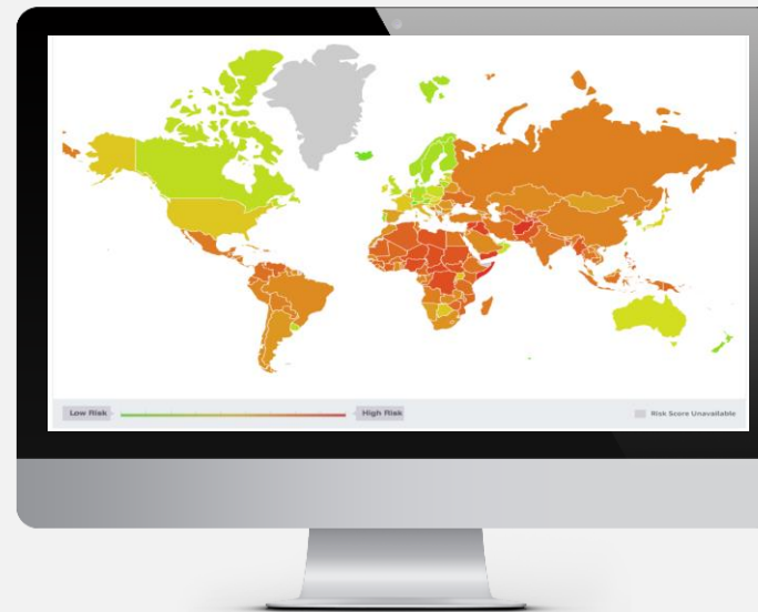
Smart Quarantine Application Platform

Citizen Data Privacy First: GDPR compliant solution and HIPAA Ready