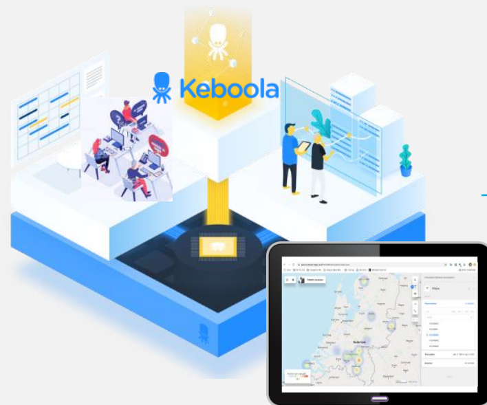
Top Down – Contact Tracing and policy driven Quarantine